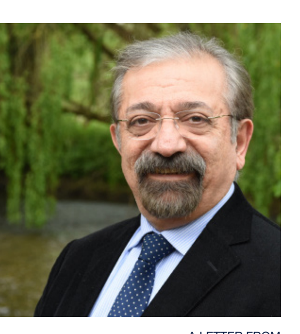
A LETTER FROM THE EXECUTIVE DIRECTOR